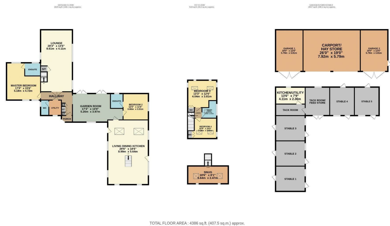
TOTAL FLOOR AREA : 4386 sq.ft. (407.5 sq.m.) approx.